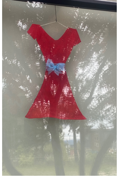
Red Dress to Support MMIW on the Highway of Tears